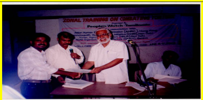
HUMAN RIGHTS AWARD