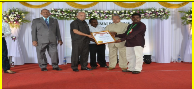
SOCIL JUSTICE AWARD