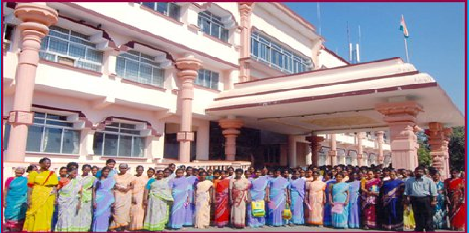
BOSS NGO's SHG Members in front of the District Collector Office