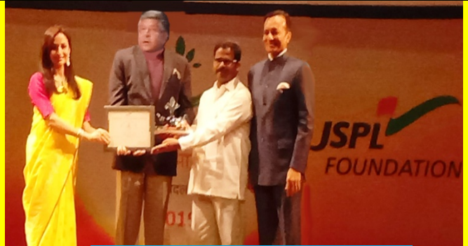
RATRIYA SWAYAM SITH AWARD